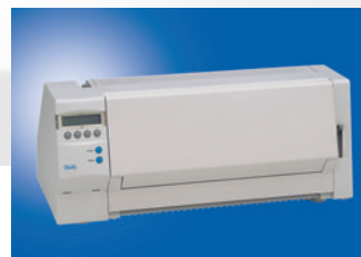
T2240: 9 or 24-wire, narrow carriage